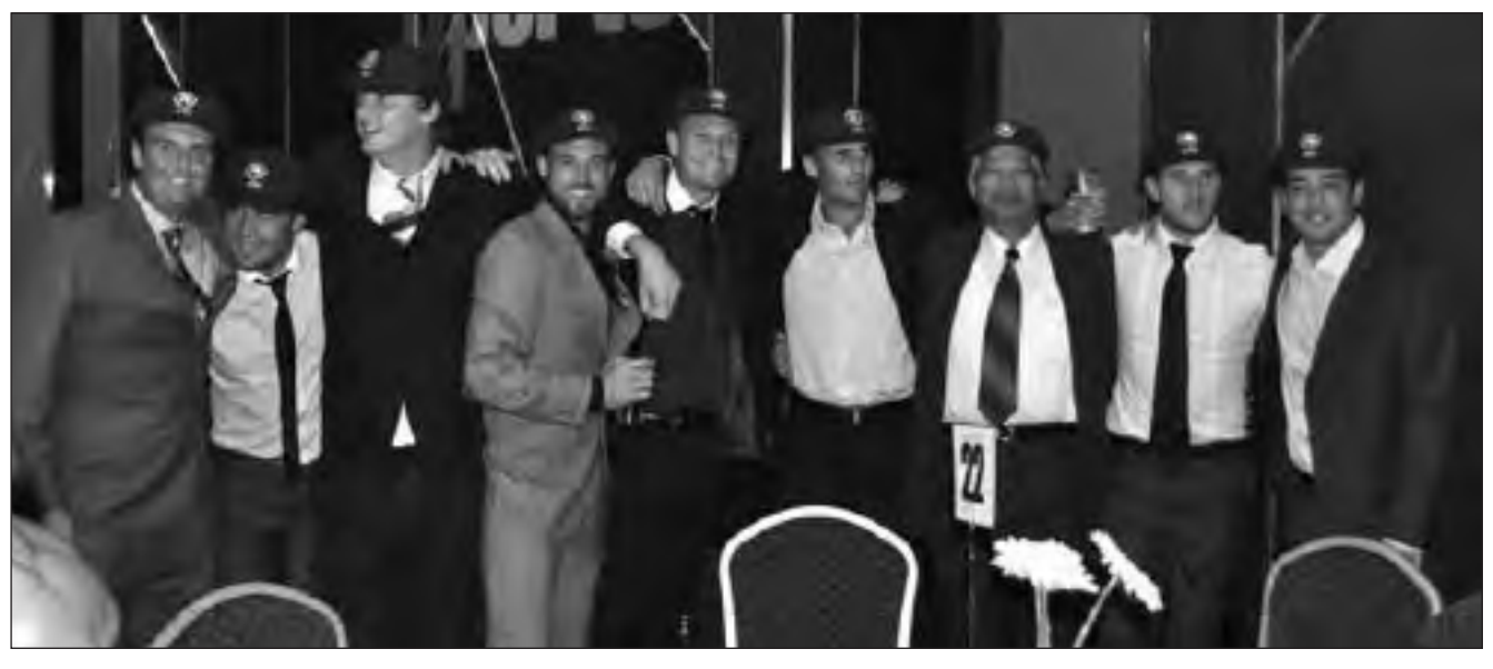
page 100 Bankstown District Cricket Club - Annual Report 2009/10