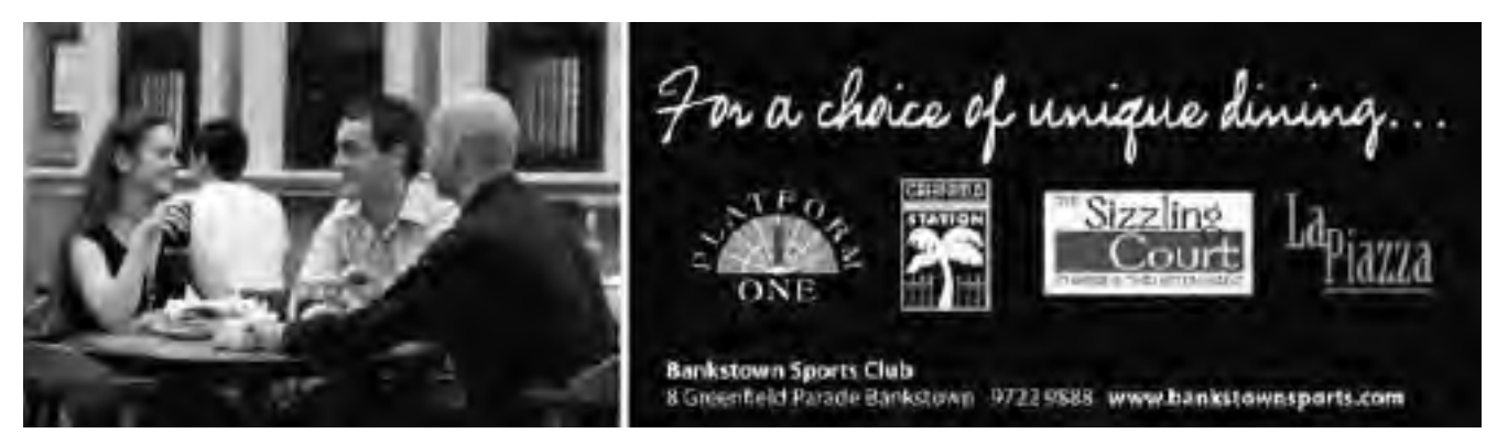
PAGE 22 BANKSTOWN DISTRICT CRICKET CLUB - ANNUAL REPORT 2009/10