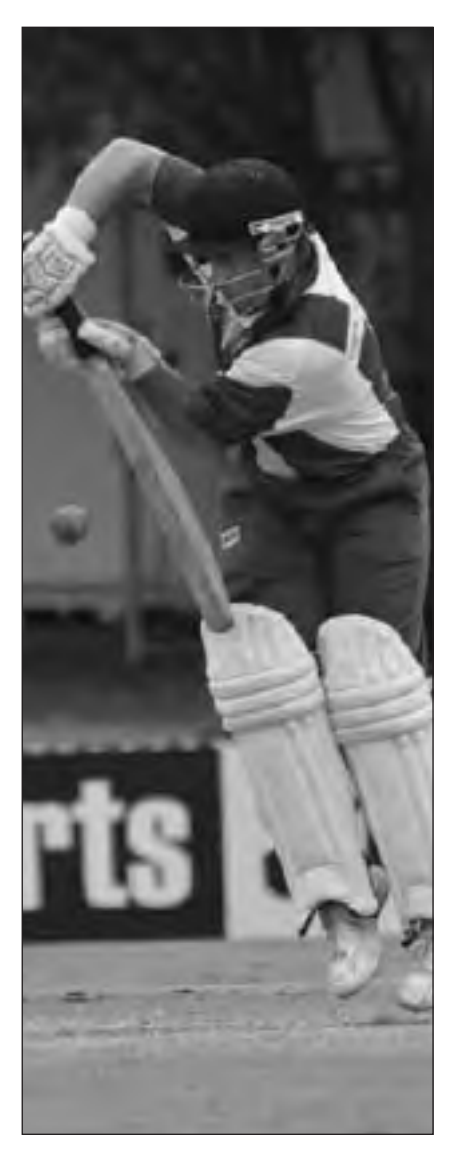
Bankstown District Cricket Club - Annual Report 2009/10 page 29