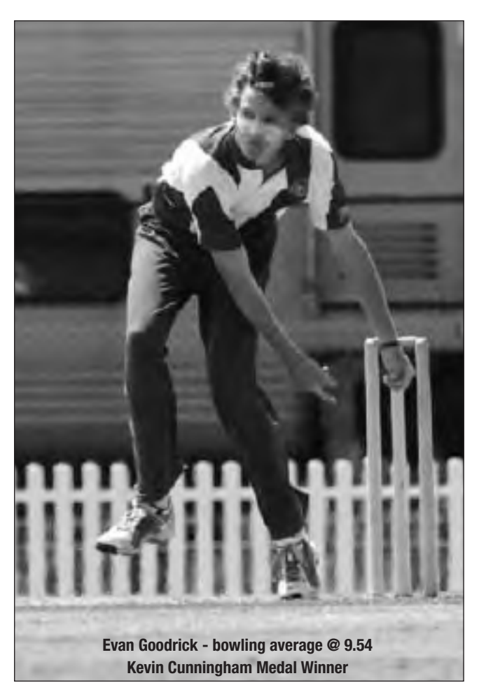
BANKSTOWN DISTRICT CRICKET CLUB - ANNUAL REPORT 2009/10 PAGE 65