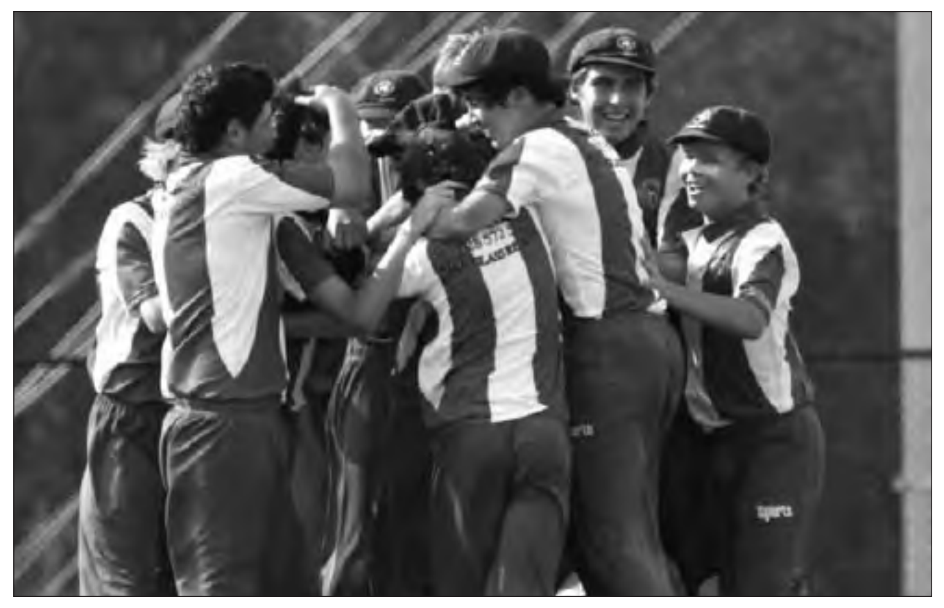
BANKSTOWN DISTRICT CRICKET CLUB - ANNUAL REPORT 2009/10 PAGE 91