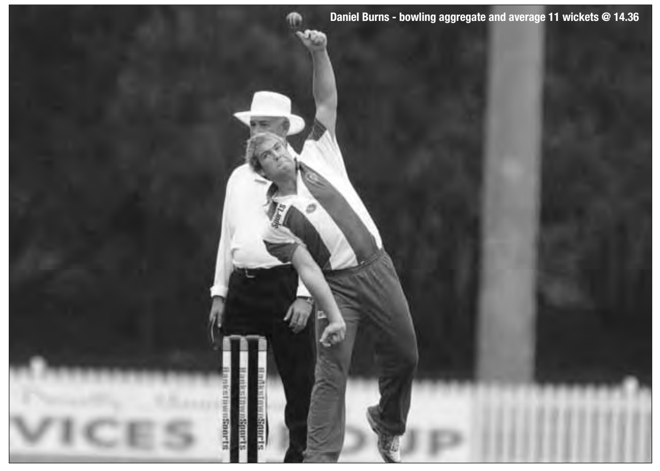
PAGE 70 BANKSTOWN DISTRICT CRICKET CLUB - ANNUAL REPORT 2009/10