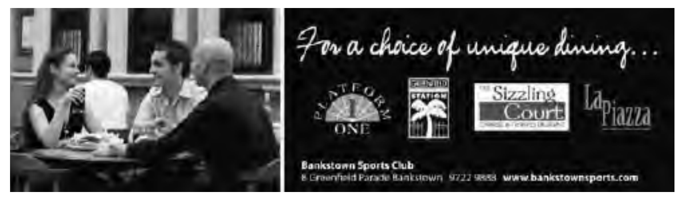
PAGE 98 BANKSTOWN DISTRICT CRICKET CLUB - ANNUAL REPORT 2009/10