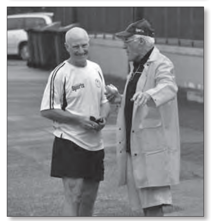
PAGE 106 BANKSTOWN DISTRICT CRICKET CLUB - ANNUAL REPORT 2009/10